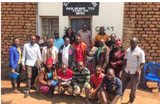
MARKUP Mission Team together with Solidaridad and Sambewe AMCOS members in Mbozi Tanzania on 24 th November 2021

The key objectives of these missions were to verify that data gathered and fed into the MARKUP monitoring system was as accurate and consistent as possible, as well as to monitor results, including unintended results, risks and assumptions. The Joint Monitoring Missions also identified best practices for replication and up-scaling.