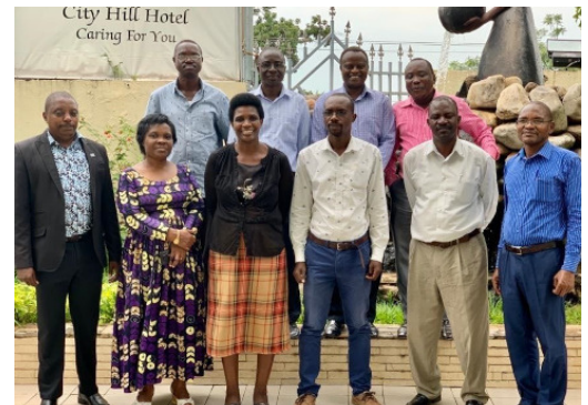
TEAM OF NATIONAL CONSULTATIONS ON COCOA STANDARDS FOR BURUNDI

Harmonised standards for products across EAC create consistency of laws, regulations and practices. They protect consumer health and facilitate the movement of products from one country to another. The East Africa Standards Committee, through its subcommittees and technical committees, takes the lead in developing harmonised standards for MARKUP priority products. MARKUP implemented by GIZ supports the Standards Committee through capacity building measures to impart the high-level knowledge and skills needed for the development and harmonisation of standards.