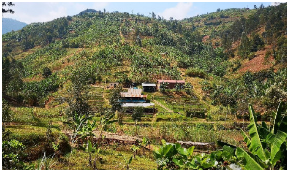
Coffee washing station in the Northern Province of Rwanda